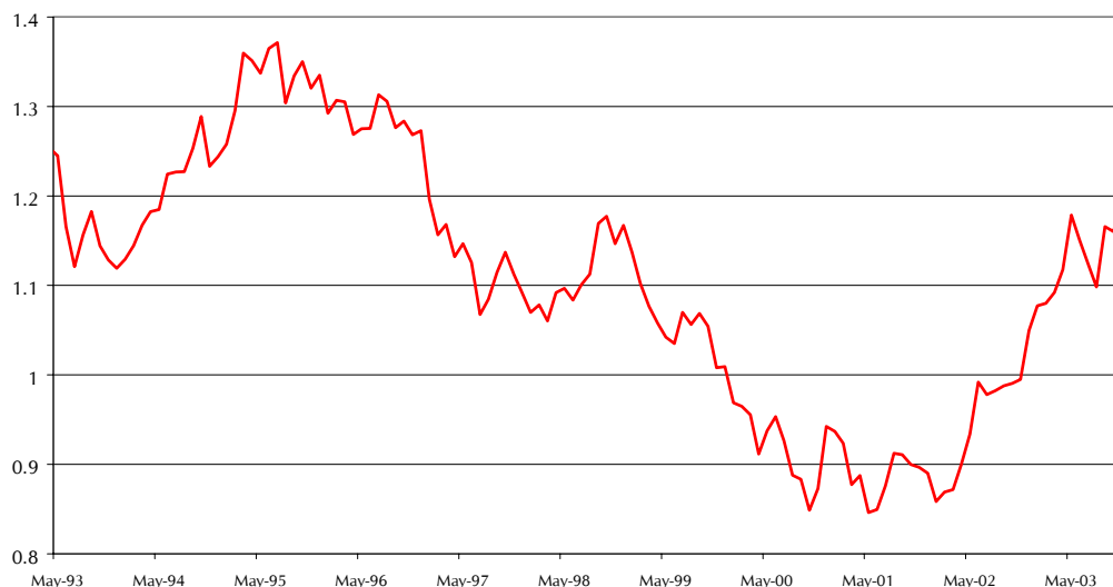
US$/EURO May 1993 - November 2003

With political/military tensions heightening in Iraq/Middle East, the financial/political conditions are ripe for a rout of the US$ and a flight into the security of gold.