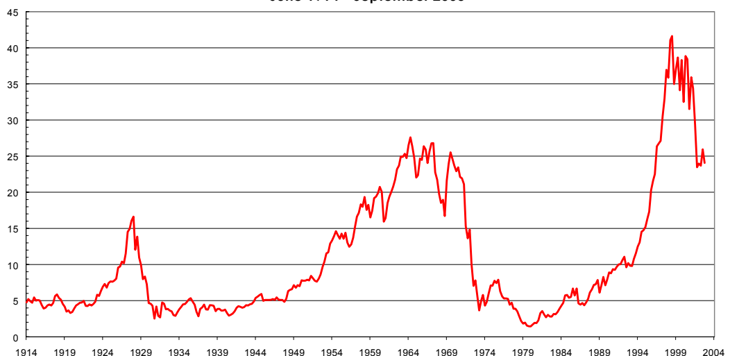
DOW JONES TO US$ GOLD PRICE June 1914 - September 2003